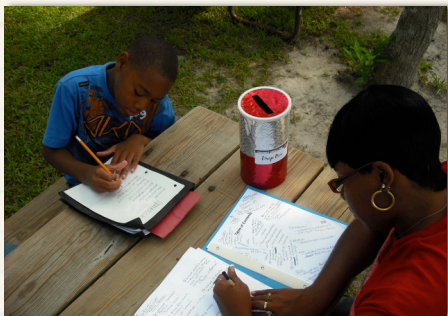
Hot off the press: the first camp newsletter.