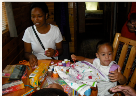
Make sure you clean off the table before cabin clean up.