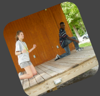
THEY ARE DANCING LIKE DAVID DID.