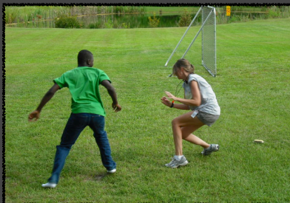
OUR CAMP DIRECTOR PLAYING ALONG WITH THE CAMPER, BUT HAS FORGOTTEN WHAT WE WERE PLAYING, SHE RAN PAST THE BACON.