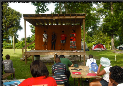
DID YOU DO YOUR CABIN CONNECTION TODAY?