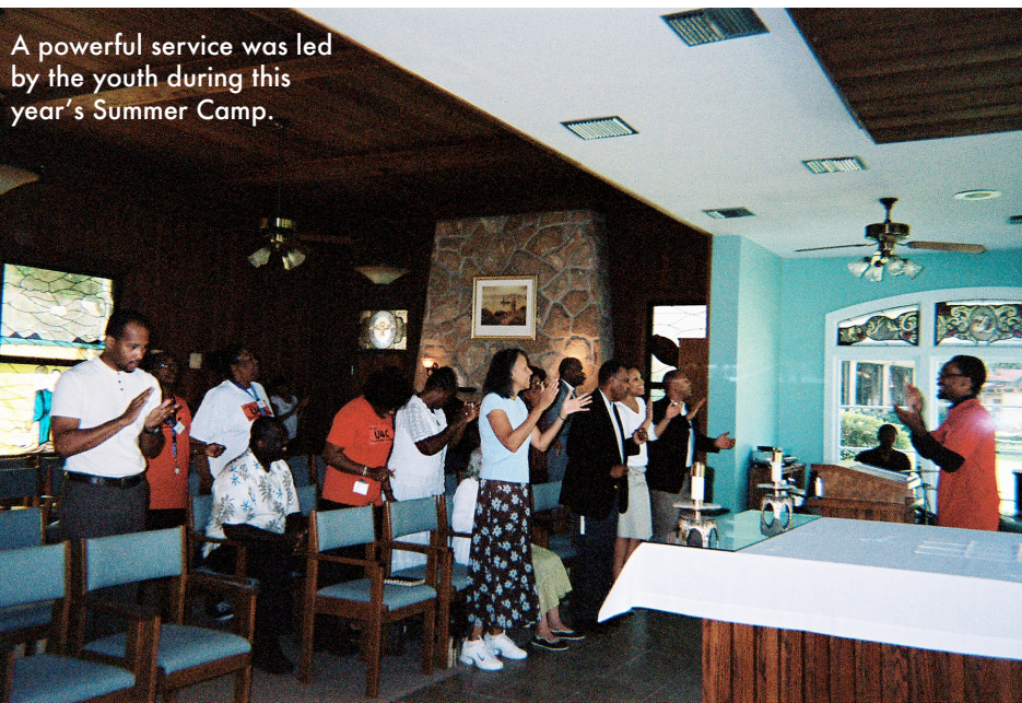
A powerful service was led by the youth during this year's Summer Camp.